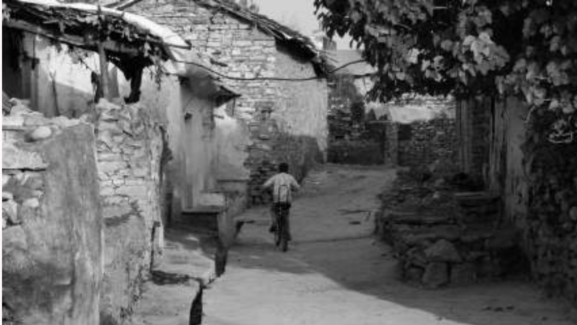
Glimpse from our recent field visit in Uttar Pradesh

Outline India is less of a survey firm and more about understanding the needs and wants of people. Field Visits provide an opportunity to immerse yourself in the actual settings where the research is taking place. Our team interacts with local communities and various sectors of the society to gain insights from their perspectives and collect authentic data for social impact .