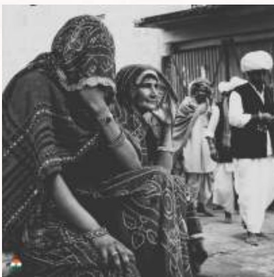
Interacting with Women in Ghoonghat